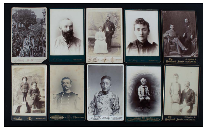
[Ten Cabinet Cards from Hong Kong Studios] Hong Kong Cabinet Cards

Ten albumen cabinet cards from six Hong Kong studios. One a portrait of a Chinese merchant, eight show European men, women, couples or children and a tenth shows a procession with crowds lining either side of the road. This image identified on the reverse in pencil as Queen's Road, Central near City Hall.