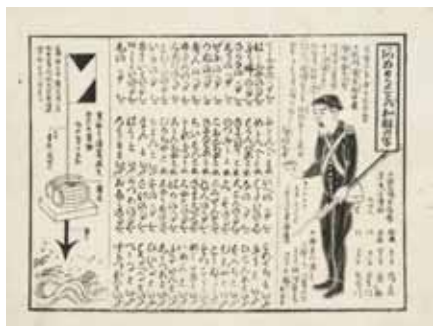
AU$1200 / Approx US$855 [162010]

Japanese woodblock kawaraban showing supposed American equivalents of Japanese words. The panel on the left describes the travels of Nagahama Manjiro (also known as John Manjiro), who was rescued by an American ship after being castaway on Torishima Island, he was then taken to the United States.