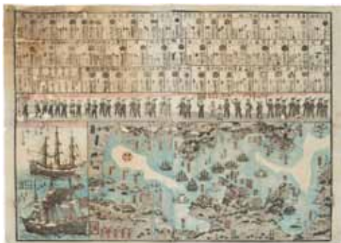
AU$2500 / Approximately US$1750 [161639]

This very striking coloured detailed kawaraban shows the arrival of Perry’s Black Ships in 1854, with images of the two types of American ships (Perry’s own and another type called called ブリガッド or Burigaddo at bottom left).