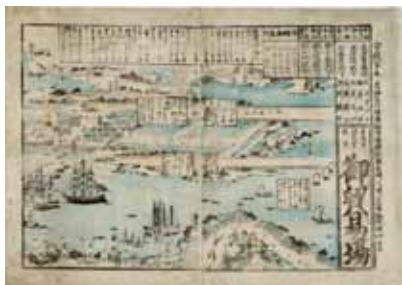
AU$2000 / Approx. US$1400 [161648]

The arrival in Japan of Commodore Matthew Perry and his “Black Ships” sent shock waves throughout Japan. The Japanese authorities did not communicate what was happening or their plans on how to deal with the situation resulting in widespread confusion and fear. Kawaraban or unauthorised woodblock newsheets, somewhat akin to modern day tweets were the population’s primary source of information about this and other events. Like tweets they were not always accurate but offer an insight into Japan and Japanese society at the time. Please visit our website to view our kawaraban catalogue “ Tweets ” from 19 th Century Japan.