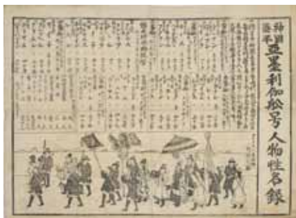
AU$2000 / Approximately US$1400 [161641]

This map of newly created western trading posts at Yokohama (Kanagawa) shows a government organisation called 御運上所 [On unjōsho] located next to foreign settlements. This organisation functioned as the tax office, a customs office, and was also involved in imports and exports.